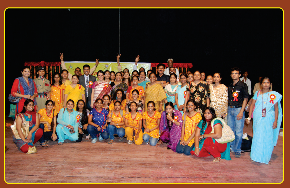
🔺 સફળતાપૂર્વક સંપન્ન થયેલ 'સબરસ-૨૦૧૦' યુવક મહોત્સવના સમાપન પ્રસંગે હર્ષોલ્લાસિત એસ.એલ.યુ.પરિવારજનો